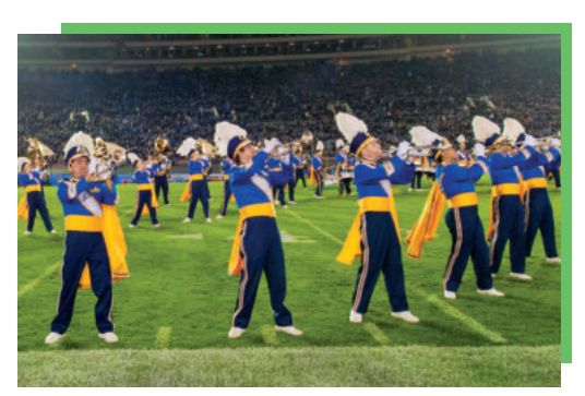
The UCLA Bruin Marching Band was established in 1921.