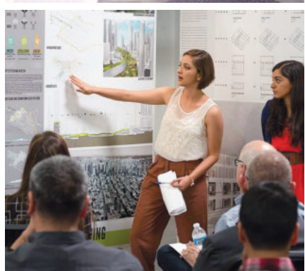
The UCLA School of the Arts and Architecture offers leading programs in four degree-granting departments: architecture and urban design, art, design/media arts, and world arts and cultures/dance.